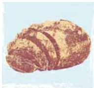
um pão de forma

uma garrafa de vinho tinto uma garrafa de água mineral dois pães de forma um quilo de açúcar meio quilo de queijo 300 gramas de fiambre